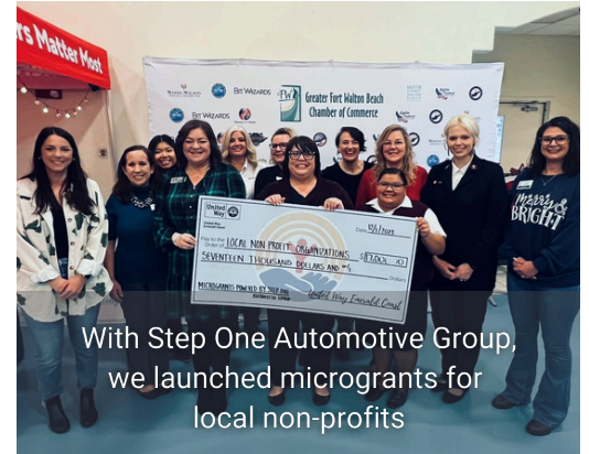
With Step One Automotive Group, we launched microgrants for local non-profits