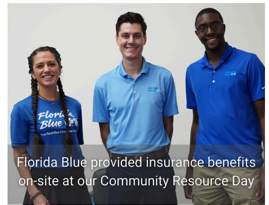
Florida Blue provided insurance benefits on-site at our Community Resource Day

United Way Emerald Coast 112 Tupelo Ave SE Fort Walton Beach, FL 32548 850-243-0315 www.united-way.org Follow UWEC: @UWEmeraldCoast