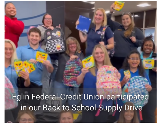
Eglin Federal Credit Union participated in our Back to School Supply Drive