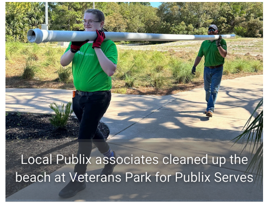
Local Publix associates cleaned up the beach at Veterans Park for Publix Serves