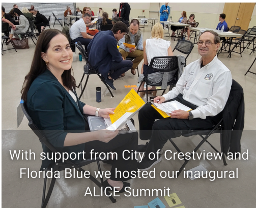
With support from City of Crestview and Florida Blue we hosted our inaugural ALICE Summit