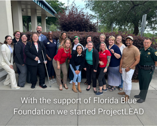
With the support of Florida Blue Foundation we started ProjectLEAD