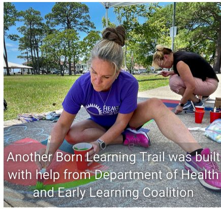
Another Born Learning Trail was built with help from Department of Health and Early Learning Coalition