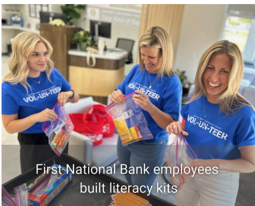
First-National Bank employees built literacy kits