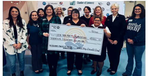
With Step One Automotive Group, we launched microgrants for local non-profits