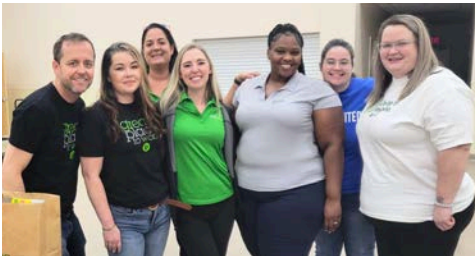
Florida Blue & Florida Blue Foundation