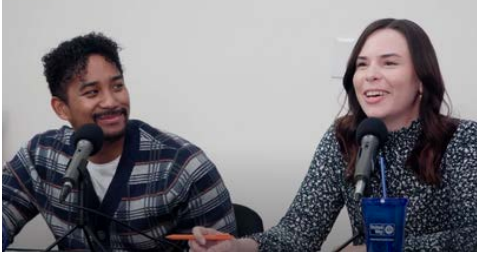
We launched our podcast, Change Starts With U , in partnership with 1Shot Creations