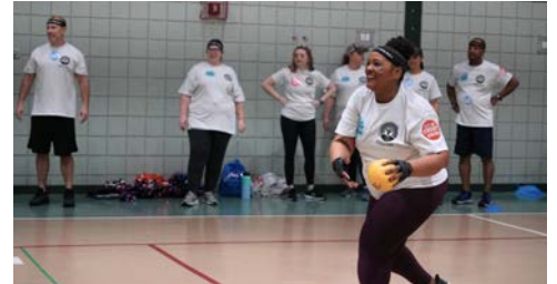
Emerging Leaders held their inaugural Adult Field Day