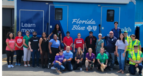
We hosted a Family Day in Walton County with our non-profit partners