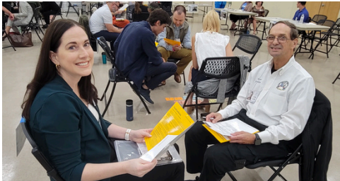
We hosted our inaugural ALICE Summit with support from City of Crestview and Florida Blue