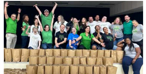
CHELCO & CHELCO Foundation