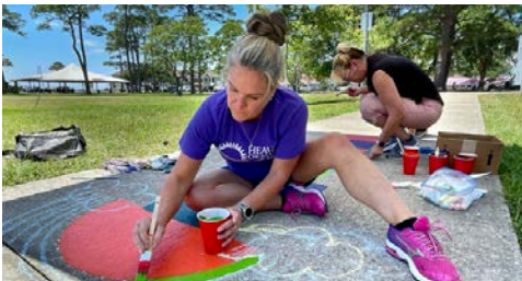
We built another Born Learning Trail with help from Department of Health and Early Learning Coalition