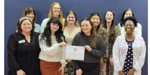
We became Service Enterprise Certified by Volunteer Florida