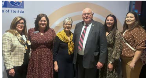
We participated in statewide advocacy to continue our support for ALICE households