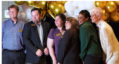
We celebrated our amazing volunteers with our friends from United Fidelity Bank